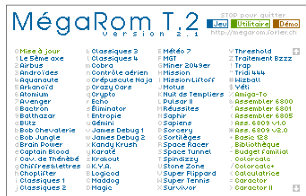
TO8, TO8D, TO9+